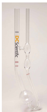
Viscometer Tube D445/6